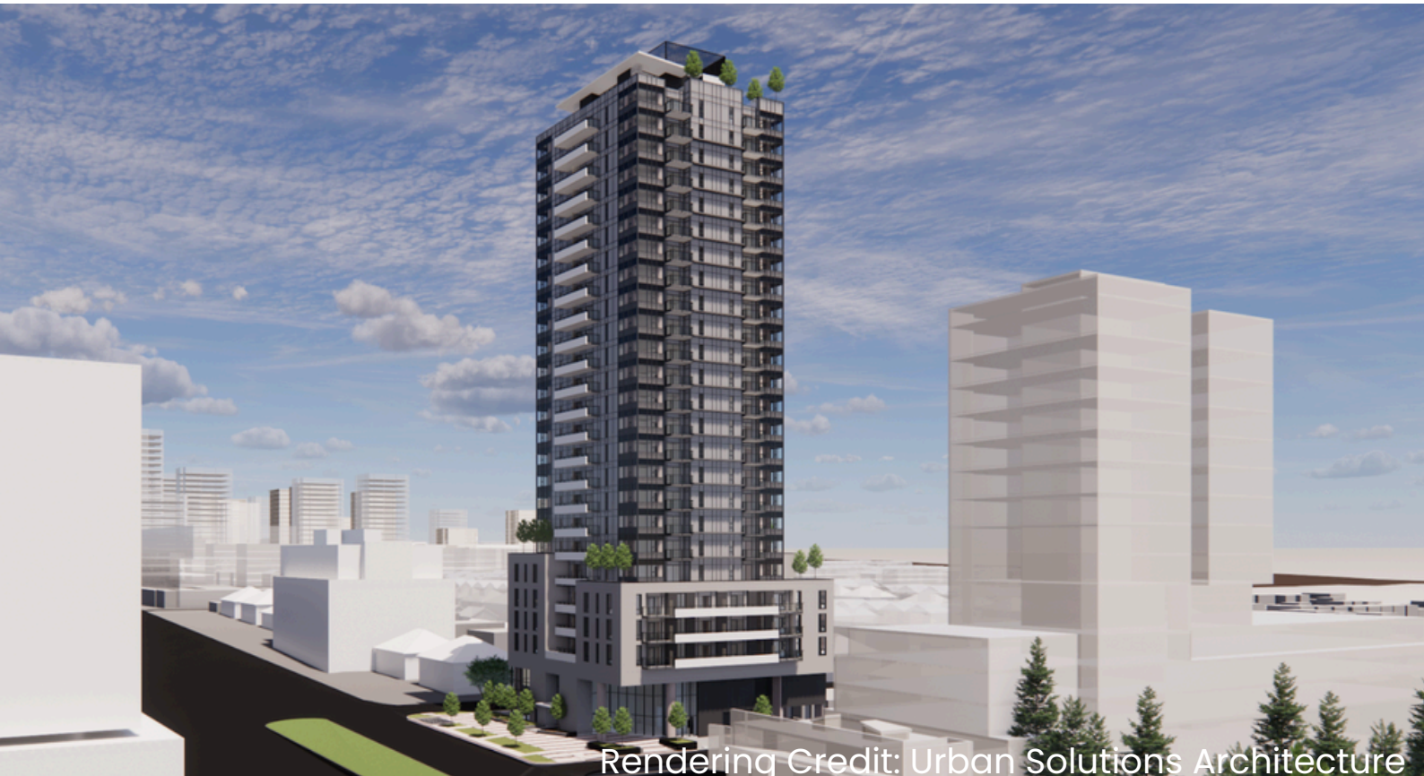
Rendering Credit: Urban Solutions Architecture